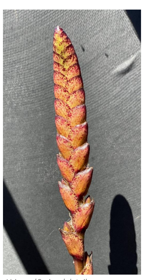
Vriesea 'Carioca' detail

What is triggering the current bloom spurt? It's presumably the lengthening days. My current bloomers are almost all hybrids. Is there a particular species that "wants" to bloom right now? Hybridists often do not share the parentage in their foliage Vrieseas, making identification challenging. Additionally, the seed and pollen parents of these hybrids are often complex hybrids themselves. That said, common species that are "in the mix" of Vriesea foliage hybrids include Vriesea species such as hieroglyphica, gigantea, fosteriana, platynema var. variegata -- and others. If you have one or more of the listed species blooming now, speak up during this month's Show-N-Tell!