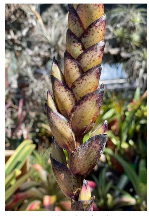
Vriesea 'Jamie Smethie' detail

Foliage Vrieseas are those plants in the genus that are grown primarily for their decorative foliage colors and bold foliage patterns. Of course, many "foliage" Vriesea hybrids have interesting and often large inflorescences, but the flowers are noteworthy for their architecture more than their color. (See photos below that focus on the cobra head like form and color patterns on the