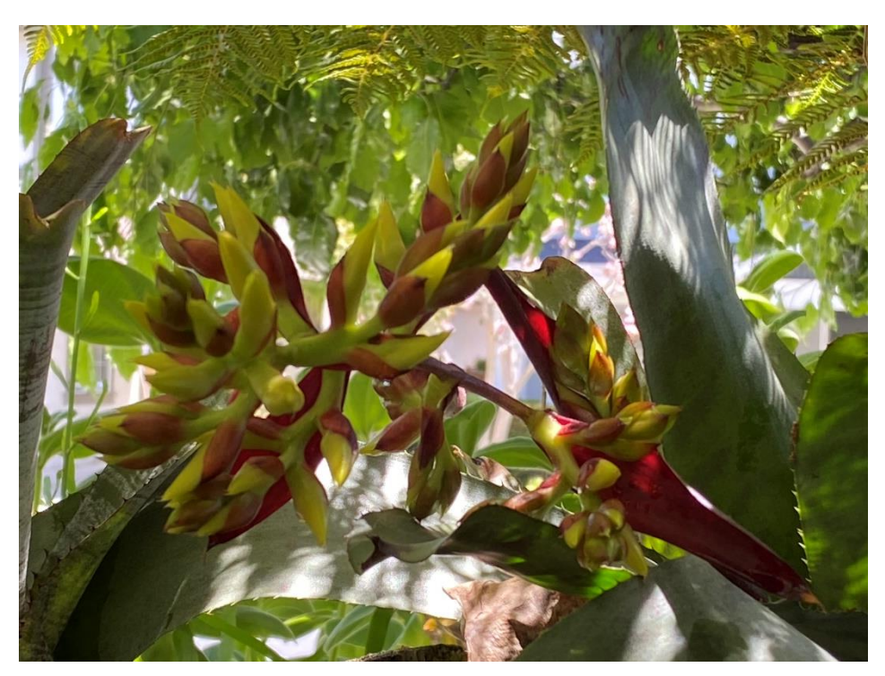
June colors: Aechmea fosteriana, Tillandsia stricta and Aechmea nudicaulis.

https://www.instagram.com/bromeliad.kingdom/. With his wide-ranging interests and lively personality, you will not be bored during this Zoom presentation.