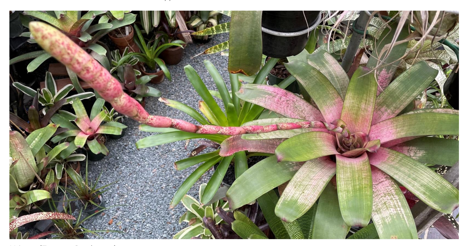
Vriesea 'Tasman Candyman'