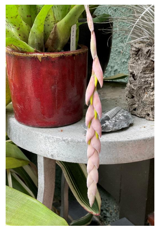
Vriesea guttata with its signature pendant habit and yellow-green flowers

The growth season for our bromeliads is in full swing. As the days get longer, our plants are in growth mode. For this month, I will focus on what's going on in my overs-stuffed collection with the members of the Vriesea genus. As if you don't have enough plant maintenance to do this summer, I thought that I would share some tips that have worked for me over the last few years.