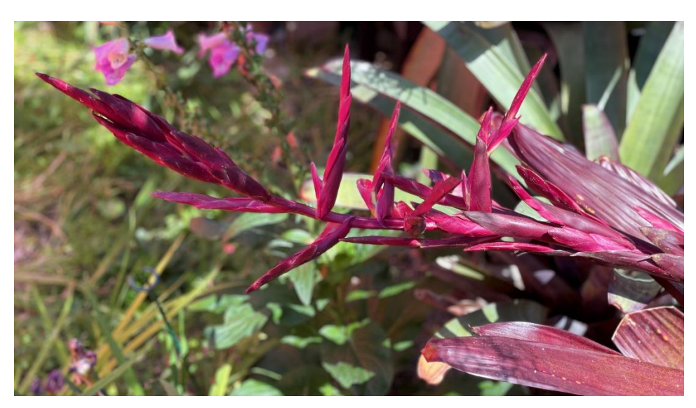
Vrieslandsia 'Twin Brother' has a few more weeks to develop before first flowers appear.

Maybe one or two of the current bloomers will develop slowly enough to be included in this summer's Bromeliad Exhibit at the San Diego Botanic Garden, which is scheduled so far for August 14-September 26!